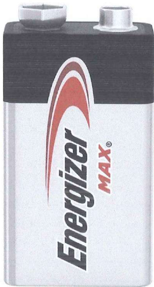
Alkaline Battery 9V