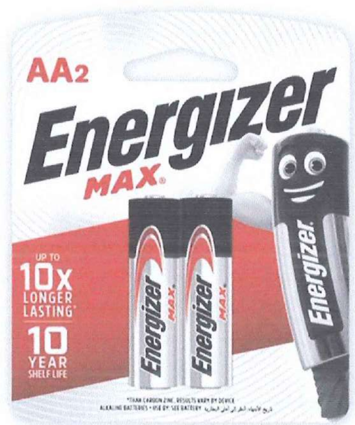
Alkaline Battery AA