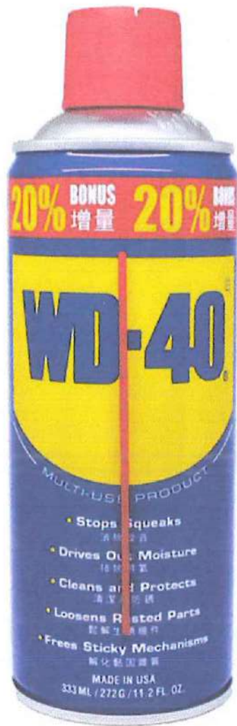
WD-40 MULTI PURPOSE LUBRICANT (412mL)